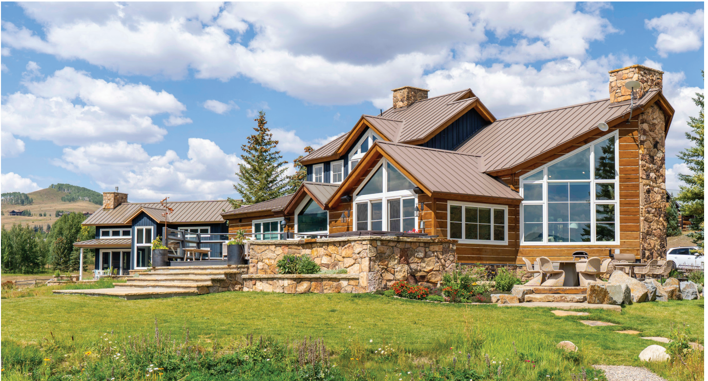
7 Moon Ridge Lane | Offered for $25,000,000