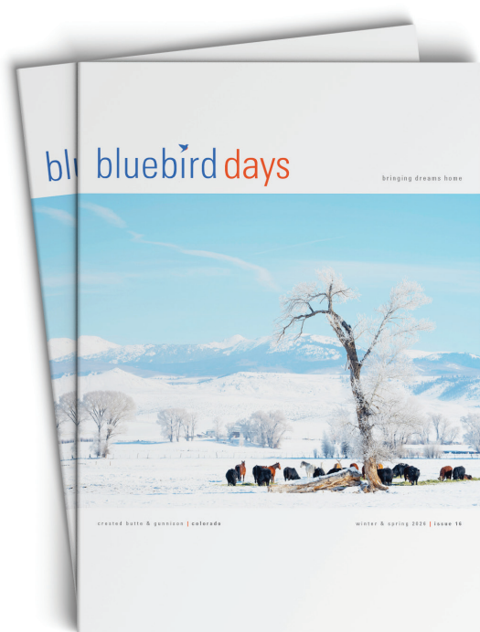
bluebird days magazine