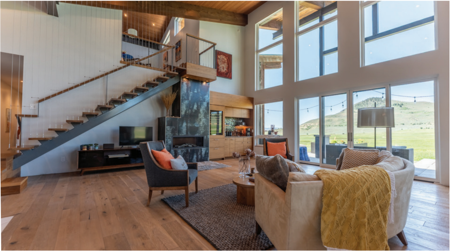
347 Overlook Trail | Offered for $5,500,000