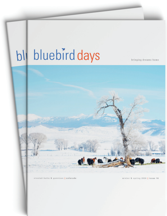
bluebird days magazine